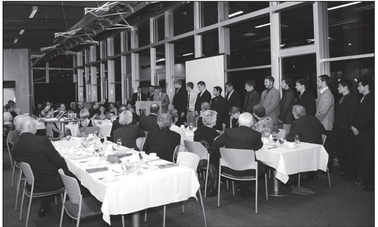
The Washington Chapter's Fall 2008 pledge class receiving scholarship grants from the Washington Alumni Association.